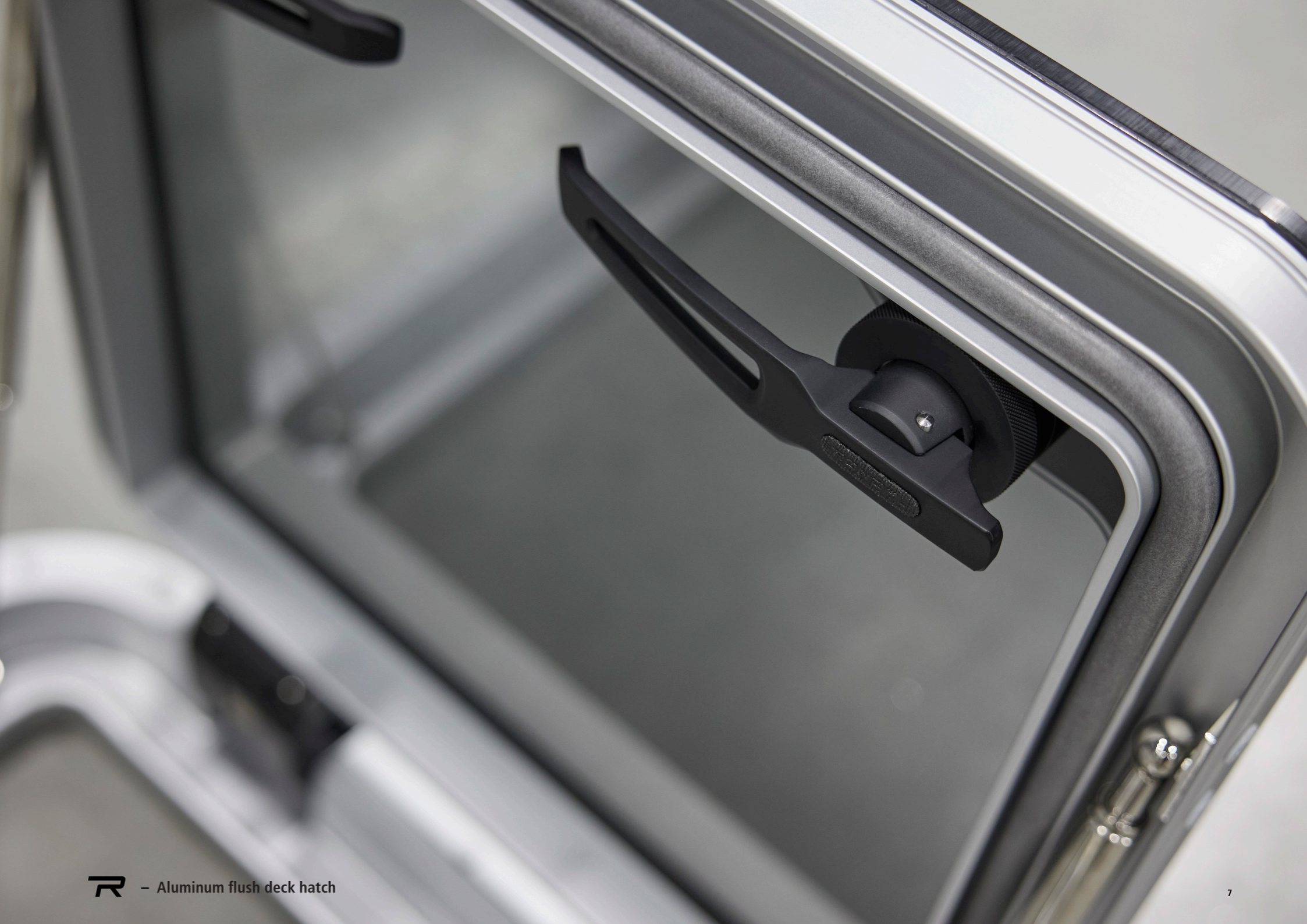
R - Aluminum flush deck hatch